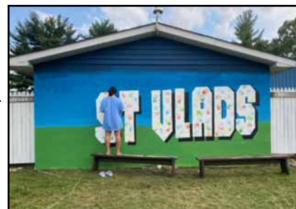
New Mural on the back of the bath houses