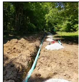
Sanitary Sewer line work